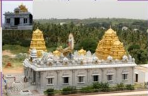
Sri Rameshwara & Sri Subramanya Temples